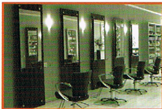
The Red Chair Salon

There are many ways to assist Pathways in raising funds. One very helpful option is to donate items or services that Pathways can auction on eBay or during its fundraising events. Items like jewelry, art, dinners, trips and services all help. For example, The Red Chair Salon at 1808 Union Street in San Francisco donates a package every year including hair styling, shampoo, massage and hair products in a spacious and comfortable environment with a unique sense of hospitality, tranquility and relaxation www.theredchairsalon.com . Pathways always receives a sizeable bid on this auction item which means more funds for our programs. Your ideas or auction item donations will be greatly appreciated!