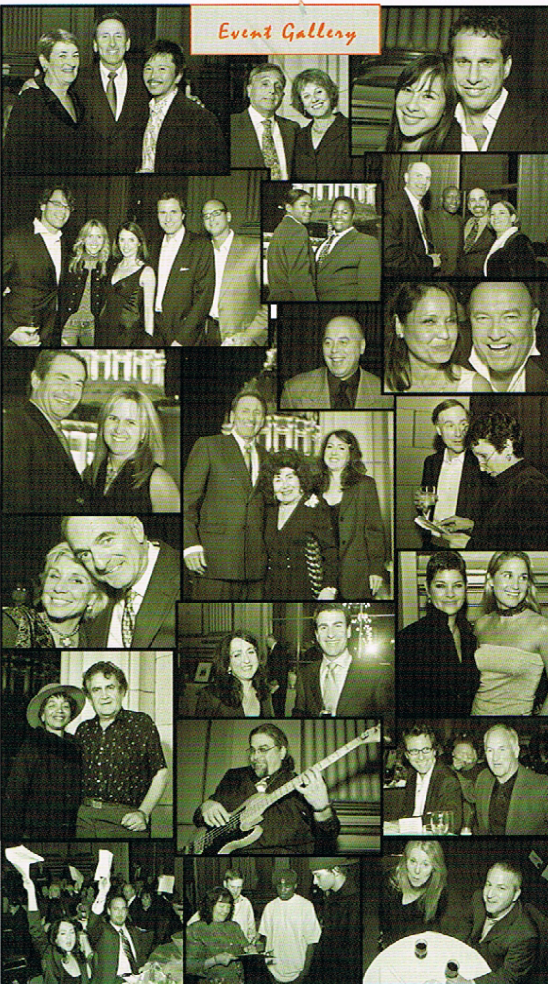
Above photos of the Pathways for Kids Annual Fundraiser at the War Memorial Veteran's Building Green Room Thursday, November 10th, 2005.

8. Become a Pathways for Kids Coach and talk to inner city kids at their school or during after school programs about your career and their future; or host a student's visit to your office.