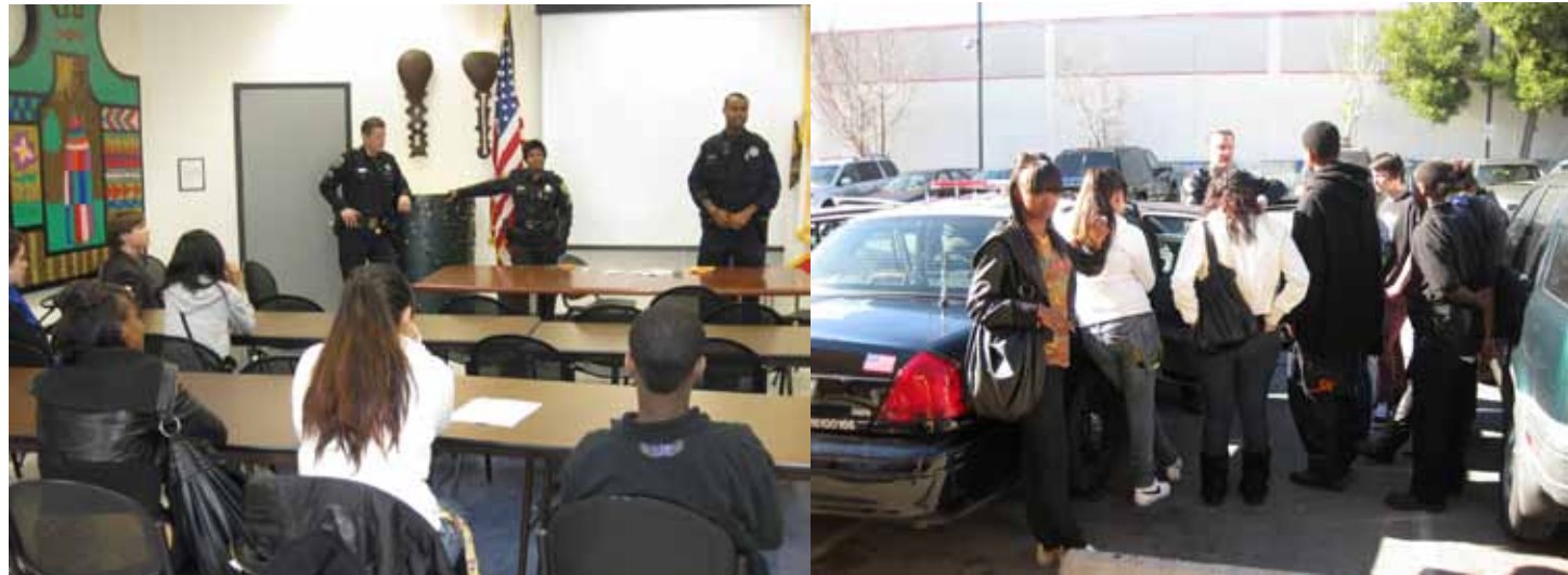
Pathways students listen as officers relate experiences working for the S. F. P. D.