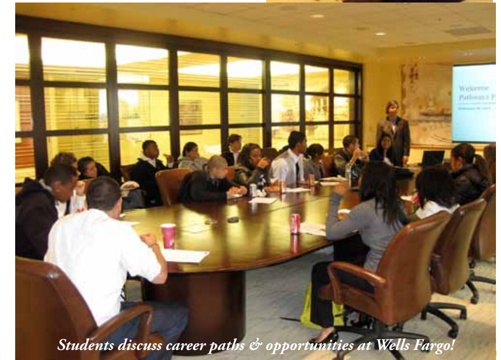
Students discuss career paths & opportunities at Wells Fargo!