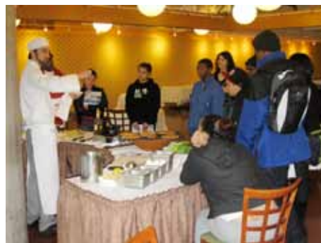
Student with chef at Ritz Carlton, SF