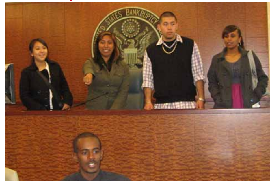
Students at US Bankruptcy Court in San Francisco

Pathways students in court? Yes, what you see in the picture above is exactly what you see! Pathways students are experiencing what it is like to be in Bankruptcy Court.