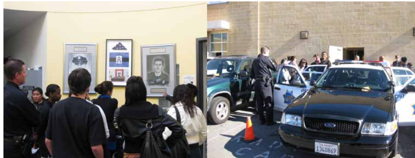
Students learn about outstanding officers honored by the SFPD