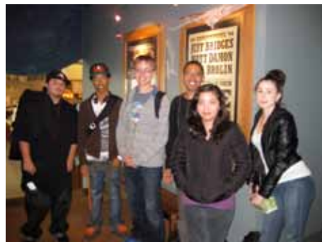
San Francisco Film Festival