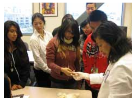
Kaiser San Francisco French Campus