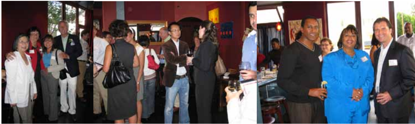
July Pathways Reception at Iluna Basque Restaurant in San Francisco