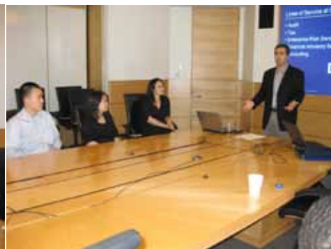
Students visit Port of Oakland