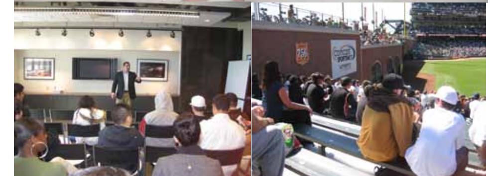
Students acquire much information about Giants Corporation and have fun enjoying a Giants’ home game after group discussions!