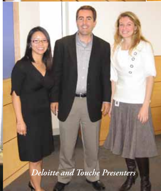
Deloitte and Touche Presenters