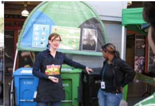
Students visit CUESA Center for Urban Education about Sustainable Agriculture