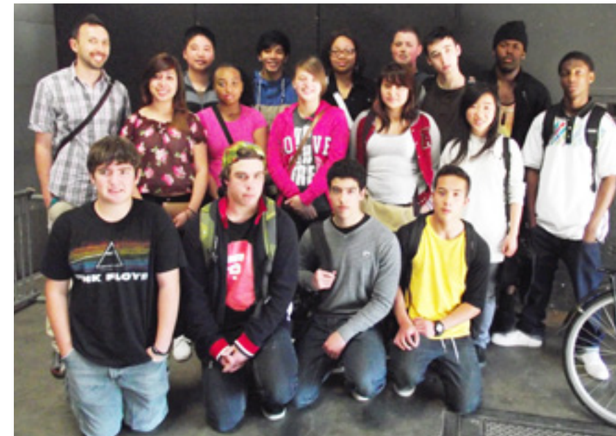
Pathways for Kids students visit The Crucible in Oakland, California.

No, we are not referring to a play or a movie when we speak of, "The Crucible." We are talking about a wonderfully exciting Industrial Arts complex located in West Oakland.