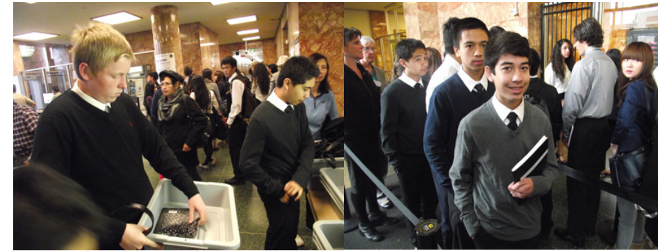
Students check in at the Hall of Justice!