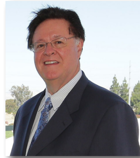
John York is a philanthropist, business man. He is the owner of the San Francisco 49ers and a well known figure in national and global philanthropic programs.