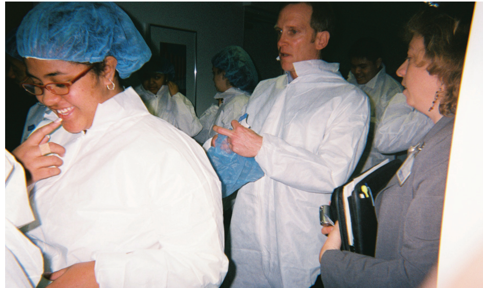
Students don "scrubs" at Kaiser Permanente in San Francisco