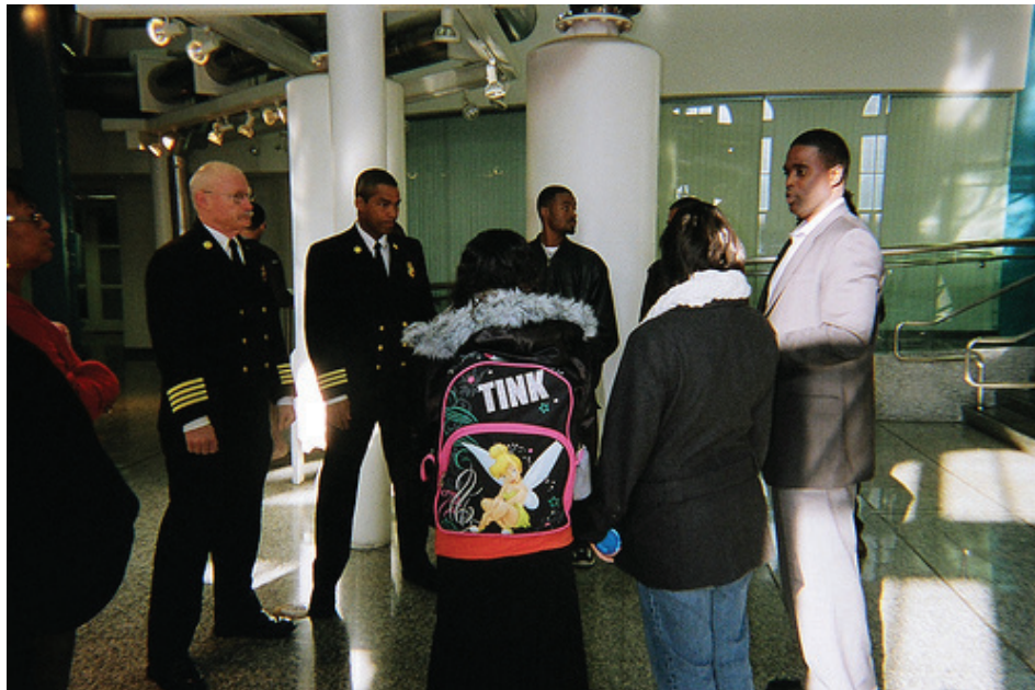
Students visit Fire Department in San Francisco.