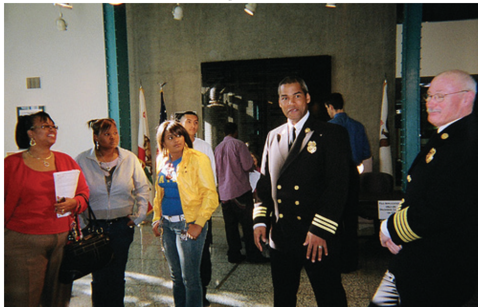
Students visit Fire Department in San Francisco.