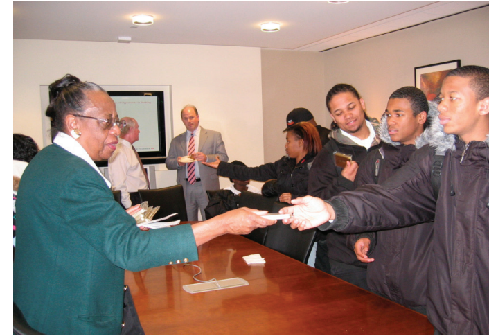
Students visit HSBC BANK in San Francisco.

We took a tour around the camp to see how everything operates. I took a tour with the person responsible for the grounds. He showed us how he cares for the lawns and everything on the premises. He was very informational. Then we had lunch. The food was very good. I hope that we can go back again.