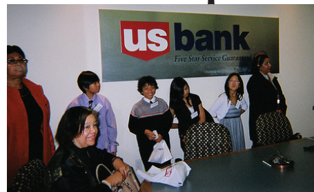
Students visit US Bank in San Francisco.