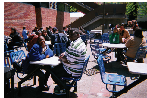
Students visit San José State Campus.

Field trips help students gain confidence and experience while exposing them to a variety of career choices!