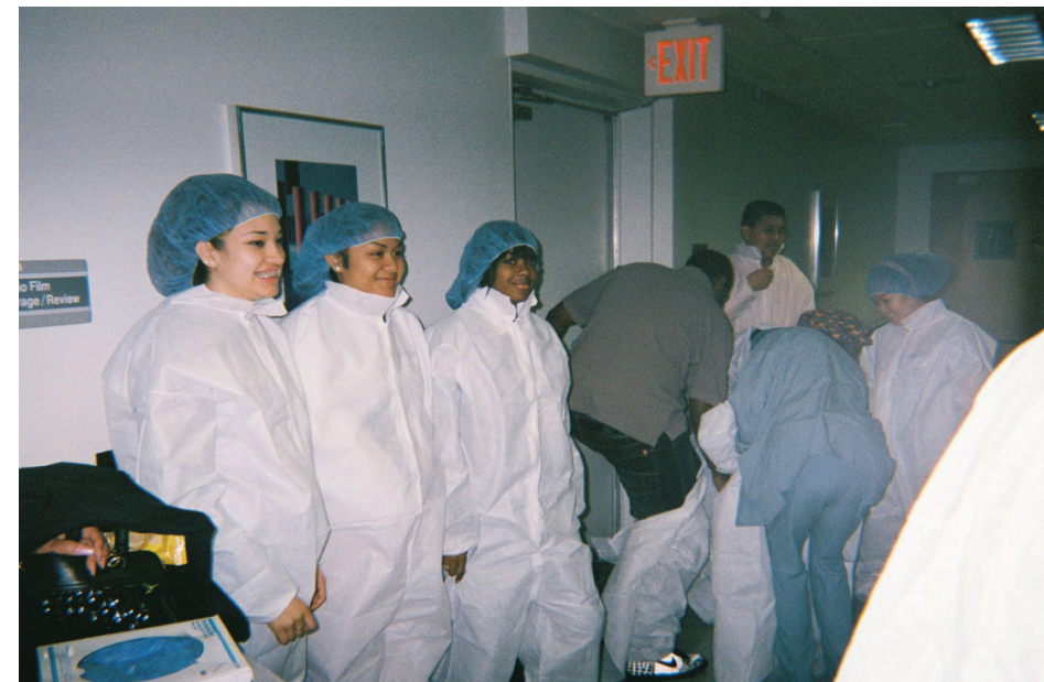
Students in the Pathways for Kids program visit Kaiser Permanente Medical Center in San Francisco.