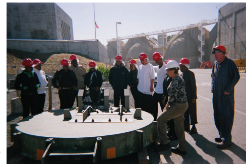
Students visit Water Utility Plant.