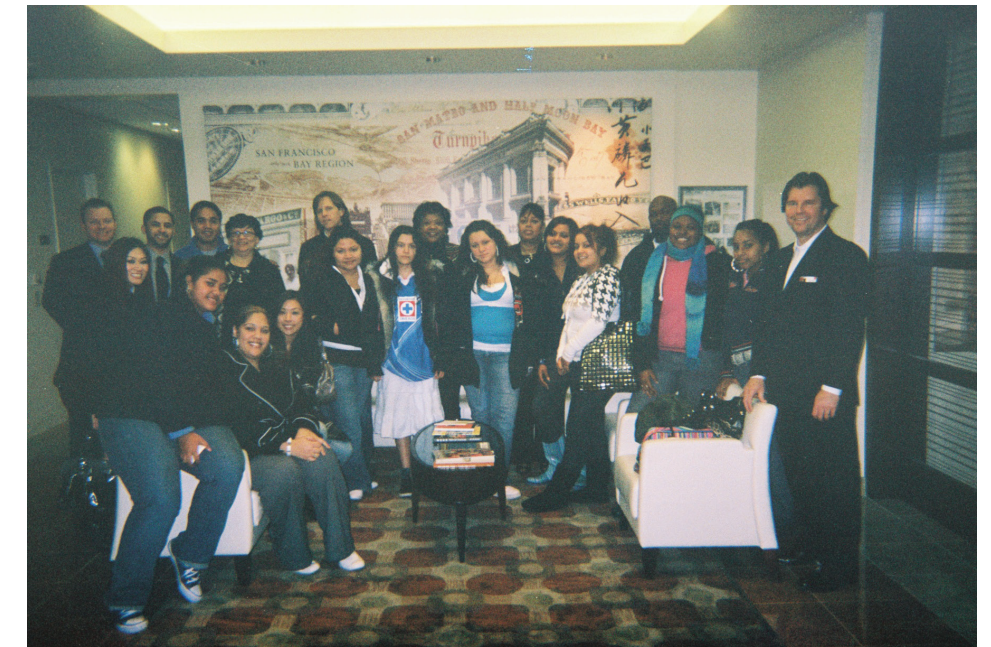
Students visit Wells Fargo Bank in San Francisco.