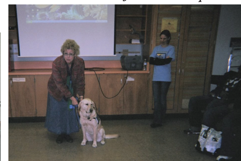
Students visit San José State Campus.