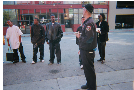
Students visit San Francisco Fire Department.