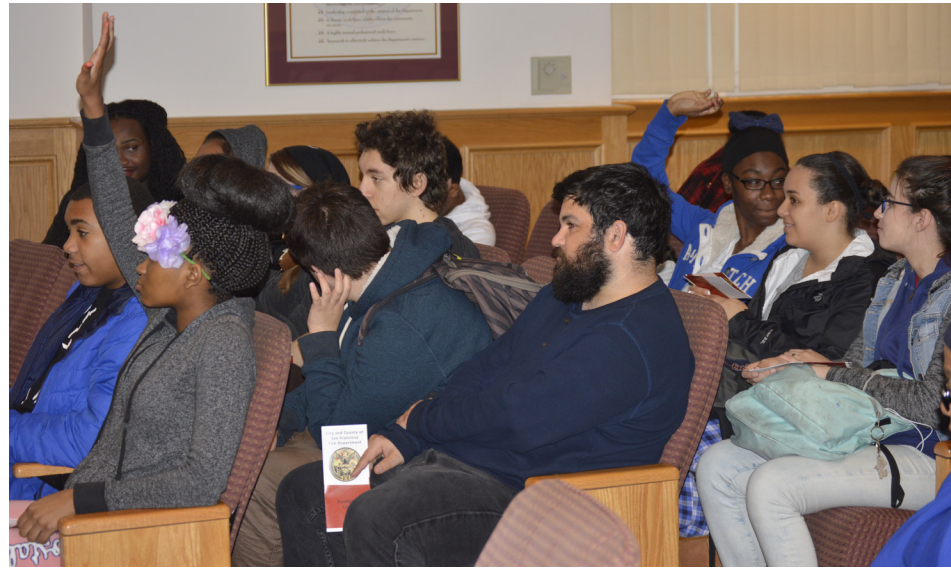
Students ask questions of SF Fire Department workshop leaders.

left the historic headquarters building and made a brief walk to see and experience a fire station in action.