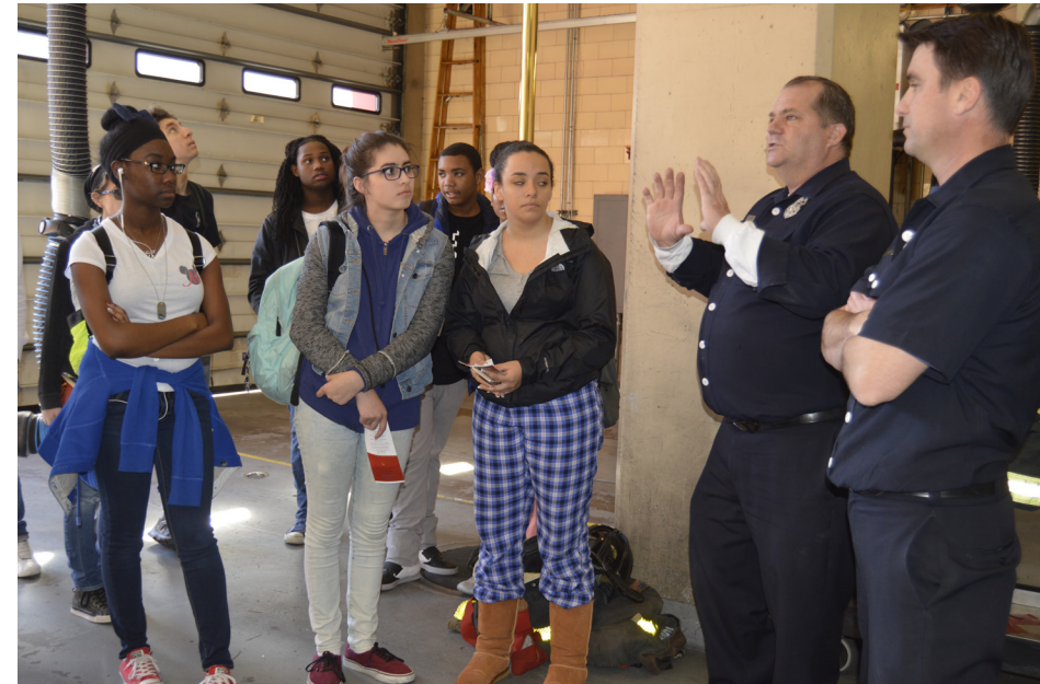
Students Enjoy a 5-Star Visit to the SFFD