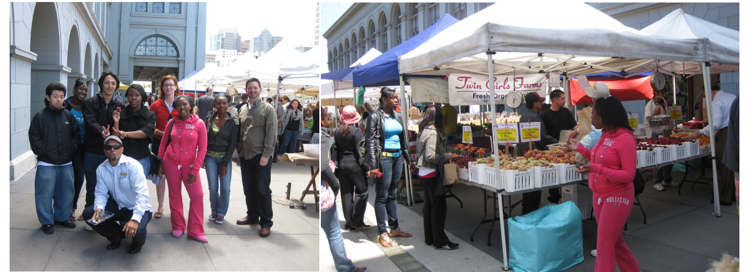
Pathways for Kids' students visit the Embarcadero Farmer's Market & CUESA