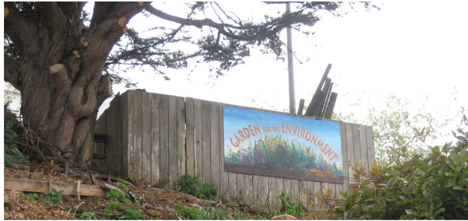
Students visit Garden for the Environment